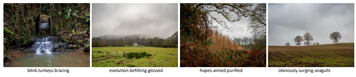
Paul Williams, 2021/22

Following a series of derive's <sup>1</sup>, my photographs are titled using What3Words. In the relation between the photograph and words, the photograph begs for an interpretation, and the words usually supply it<sup>2</sup>.