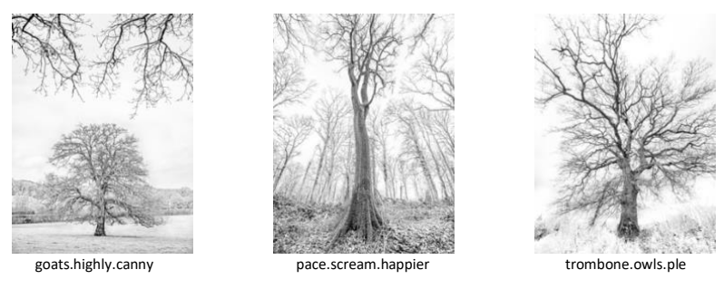
Paul Williams, 2021/22

The following images taken on my derive's are edited for a more sculptural aesthetic. 'Evidence of time is revealed in the furrowed bark of an ancient tree, gnarled, crooked, and beautiful' (Beth Moon<sup>3</sup>).