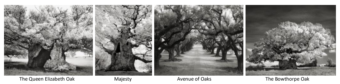
Beth Moon, Portraits of Time, 2014

The following images taken on my derive's are edited for a more sculptural aesthetic. 'Evidence of time is revealed in the furrowed bark of an ancient tree, gnarled, crooked, and beautiful' (Beth Moon<sup>3</sup>).